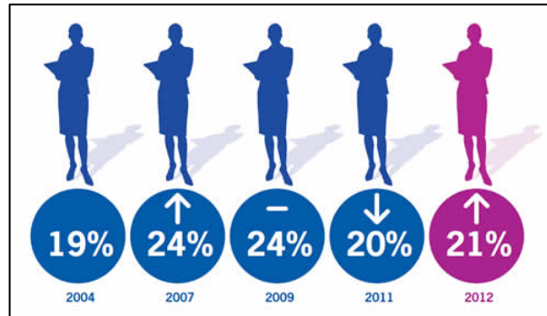
Image from the Grant Thornton 2012 IBR

percentage of women in senior management globally. Their statistics show that women made up only 21% of senior managers globally in 2012 with insignificant fluctuation and no real increase since 2004.