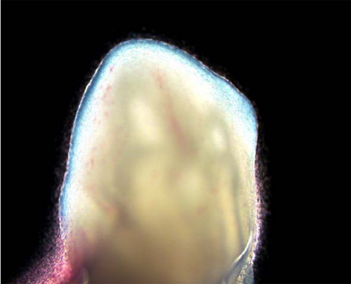
FIGURE 1: APOPTOSIS IN CHICK EMBRYO WING BUD AT DAY 7 OF DEVELOPMENT

This figure shows the apoptosis in the wing bud of an embryonic chick at day 7 of development at 10X magnification on the stereoscope. The dead cells at the wing tip took up the Nile Blue A stain in the beginning stages of digit morphogenesis.