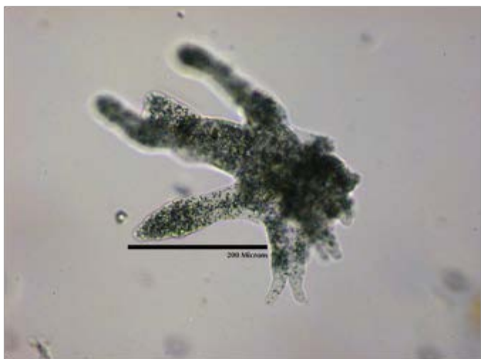
Figure 1.2: Observation of amoeba after being treated with nocodazole, displaying nine pseudopods extending from a